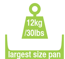
largest size pan